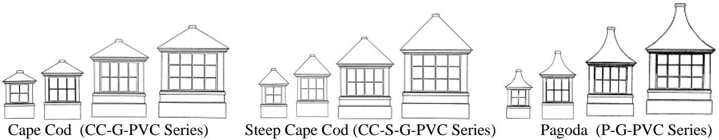
Cape Cod (CC-G-PVC Series)