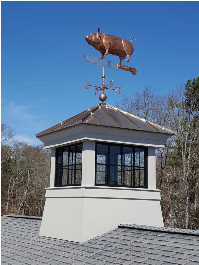
Custom cupola and weathervane for the Cask and Pig restaurant, North Dartmouth, Mass